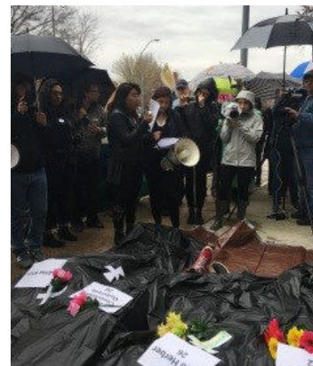
Photo: "Die In" in light rain at Thom Tillis' office in Raleigh. Photo Credit: Gailya Paliga